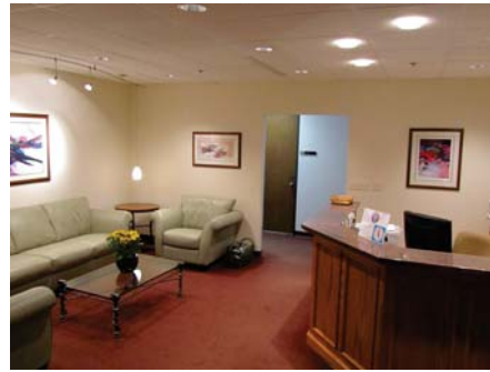
3rd Floor Reception Area